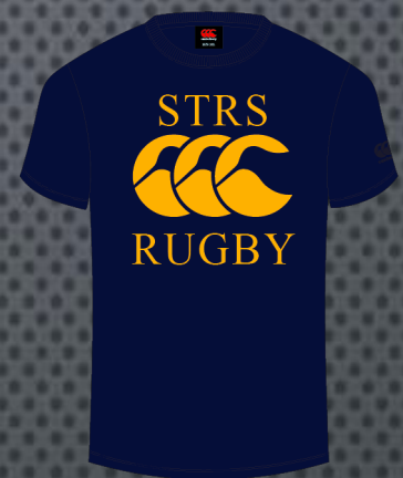
Printed Tee Snr £13.50 Jnr £9.50