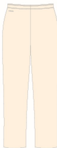
Cricket Pant Snr £25 Jnr £20