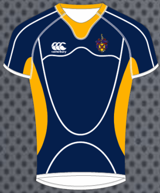
Rugby Shirt Snr £40 Jnr £30