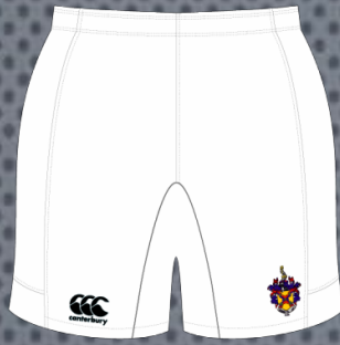
Advantage Shorts Snr £20.00 Jnr £17.00