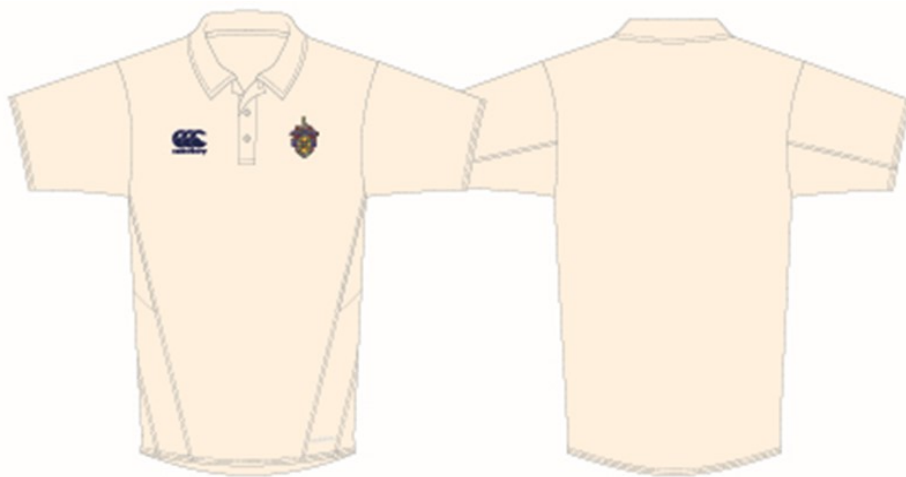
Cricket Shirt Snr £25 Jnr £20