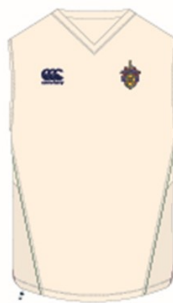
Cricket Jumper Snr £32.50 Jnr £25