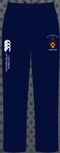
Open Hem Stad Pants Snr £32.00 Jnr £23.00