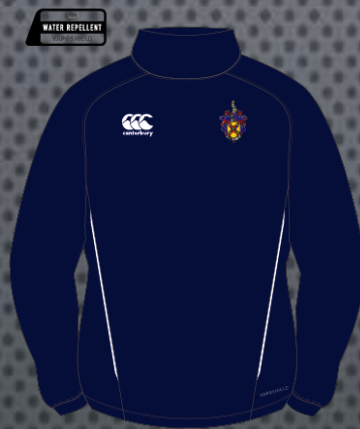
Team Contact Top Snr £32.00 Jnr £28.50