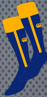
MTO Socks Snr & Jnr £7.50