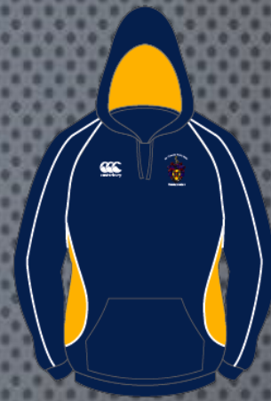
Side Panel Hoody Snr £39.00 Jnr £30.00