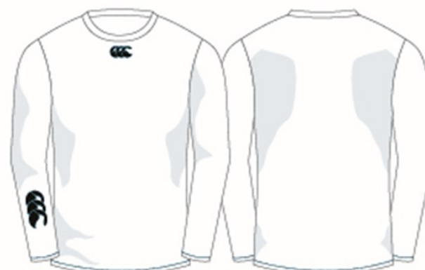
Baselayer Snr £30 Jnr £27.50